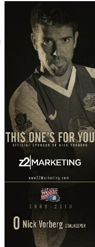
Player Sponsor Banner