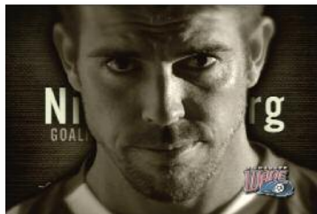
Jumbo Screen Intro Video